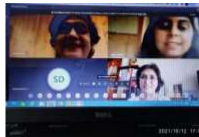
Feedback Analysis : Session 1